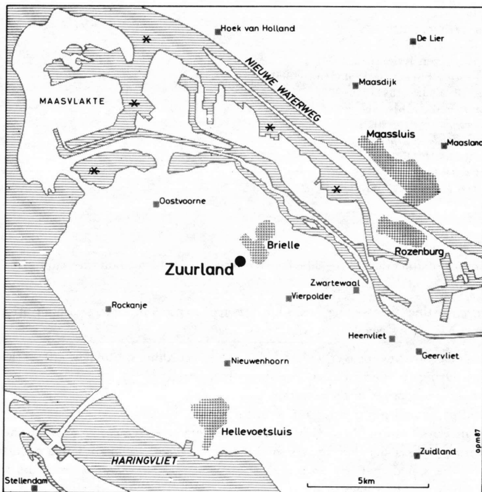
Fig. 1. Map showing the location of the Maasvlakte area, borehole Zuurland, and the places (*) where the sediments used for the creation of the Maasvlakte were obtained by suction-dredging.

is fragmentary, caused by the way in which the fossiliferous sediments were obtained and transported to the Maasvlakte.