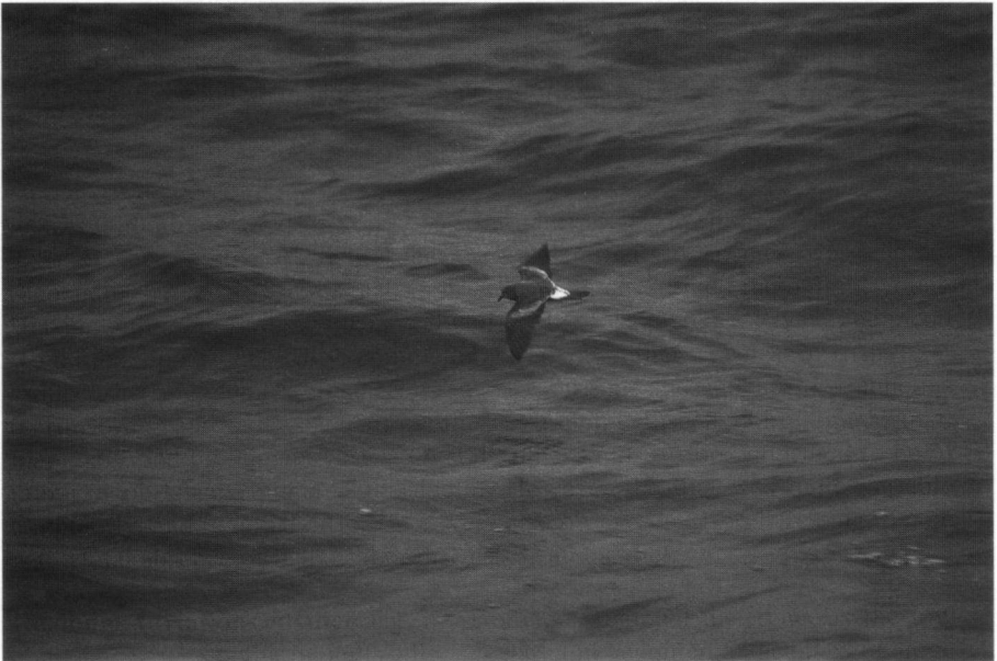
Leach's Petrel Vaal Stormvogeltje