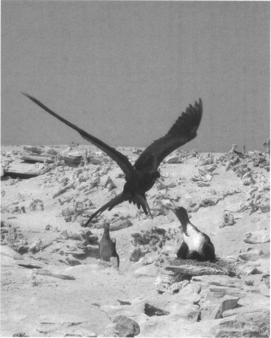
Male Magnificent Frigatebird landing near the nest on Ilhéu de Curral Velho Bij het nest landende man Amerikaanse Fregatvogel op Ilhéu de Curral Velho (P. López Suárez)