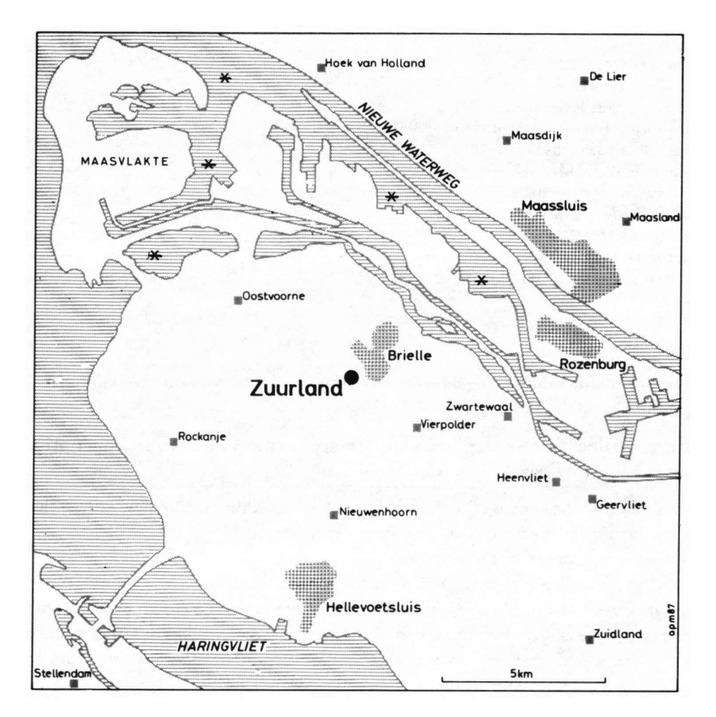
Fig. 1. Map showing the location of the Maasvlakte area, borehole Zuurland, and the places (*) where the sediments used for the creation of the Maasvlakte were obtained by suction-dredging.

is fragmentary, caused by the way in which the fossiliferous sediments were obtained and transported to the Maasvlakte.