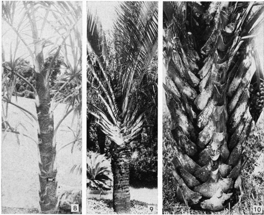
Plate IV fig. 8. Wallichia disticha with two vertical rows of leaves; fig. 9. Neodypsis decaryi showing three vertical rows of leaves; fig. 10. Trunk of Syagrus treubiana bearing five vertical rows of leaf scars.

In palms like Nypa fruiticans which do not form an aerial trunk, the leaves that are produced from the horizontally spreading rhizomes, grow slantingly upwards one alternating with another in a zig-zag manner. Any two successive leaves subtend a narrow angle (upwards) that bears more or less a Golden Proportion to the remaining wider angle.