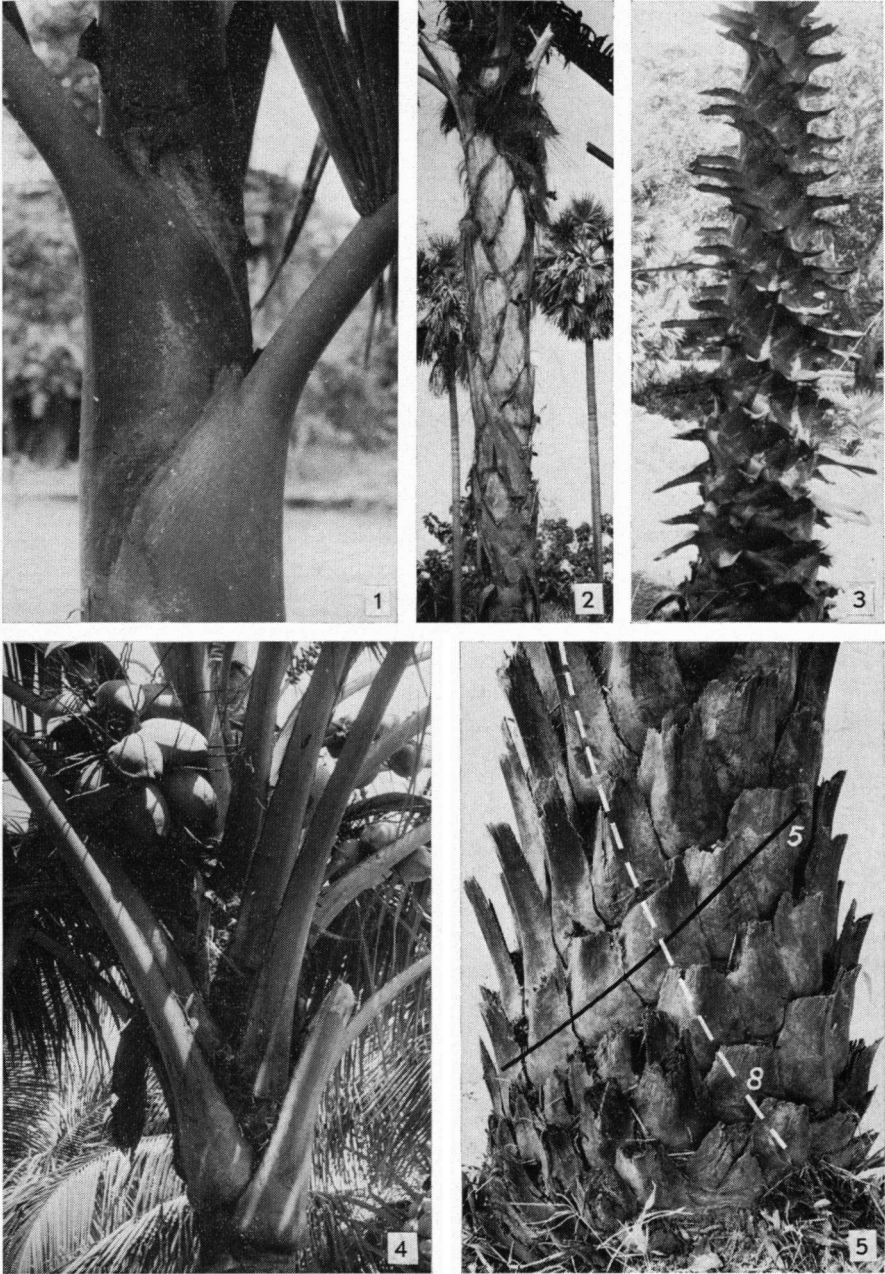
Plate I fig. 1. A left-spiralled Areca catechu ; fig. 2. Two-spiralled trunk of Arenga saccharifera ; fig. 3. Stem of Borassus flabellifer having three spirals; fig. 4. The crown of Cocos nucifera showing left-handed foliar spiral; fig. 5. Trunk of Elaeis guineensis displaying eight and five spirals.