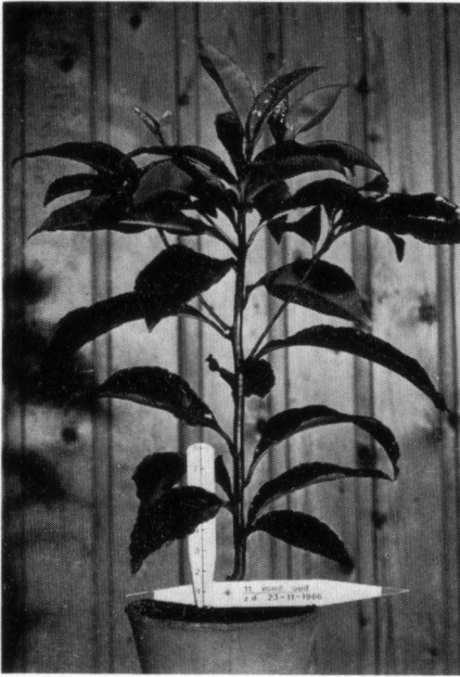
Fig. 2. A healthy, bacteria containing, Ardisia crispa plant. Age: 11 months.