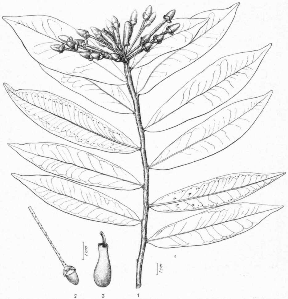
Plate 3. Marcgravia patellulifera , habit, flower and nectary. Fig. 1 after Aristeguieta 4460 , figs. 2 and 3 after Steyermark et al. 95168 .