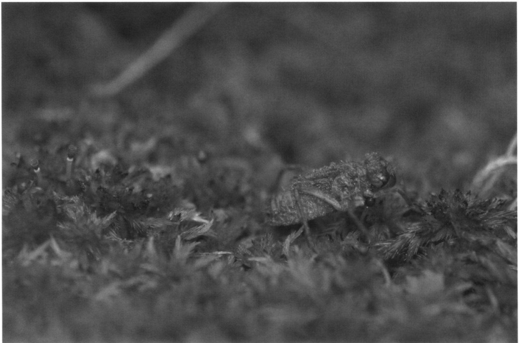
Figure 1. A larvae of Somatochlora arctica found at Wooldse veen.

Somatochlora arctica is very rare in Western Europe and shows a rather scattered distribution. At the western edge, the species is known only from a few locations in south-western Ireland and northern Scotland (HAMMOND & MERRITT, 1983; NELSON & THOMPSON, 2004). The species is also very scarce in Denmark, occurring in only a few locations (NIELSEN, 1998). Somatochlora arctica is not known from Luxembourg and only occurs in the eastern part of Belgium (DE KNIJF ET AL., 2006). In France, although the species