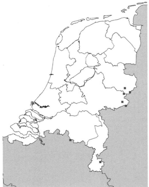
Figure 4. Location of current populations of Somatochlora arctica in the Netherlands (2009). Note that all populations are situated relatively close to the Dutch border.