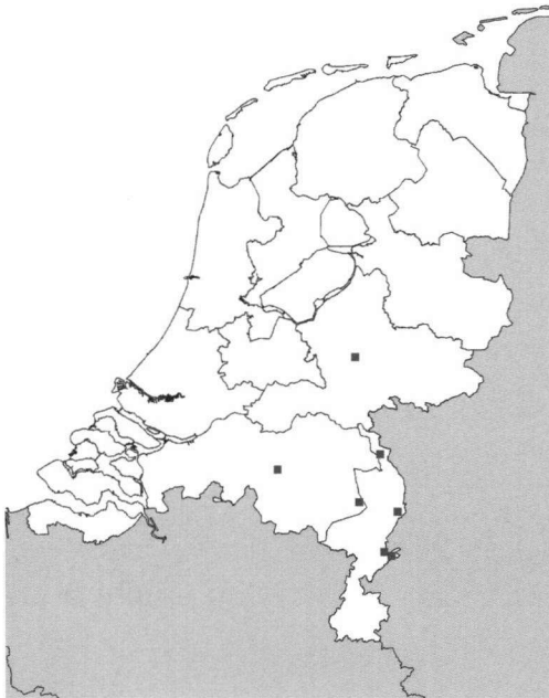
Figure 3. Former distribution of Somatochlora arctica in the Netherlands (1900-1995).