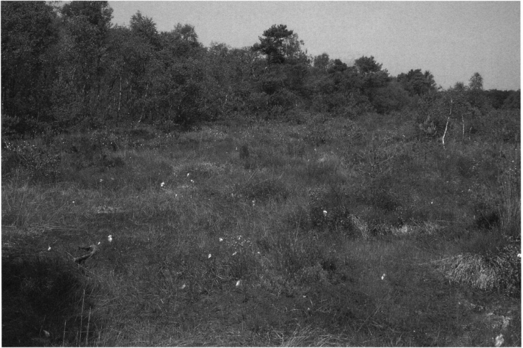
Figure 2 Characteristic reproduction habitat of Somatochlora arctica at Wooldse Veen, Gelderland, close to the German border, 8 June 2007.