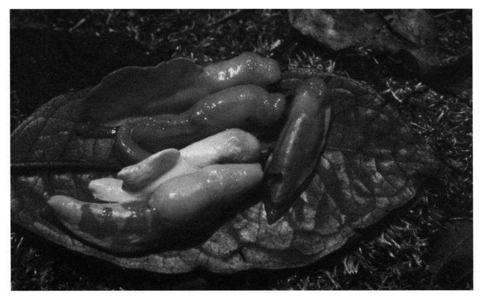
Fig. 1. Group of Emphysetes udzungwensis spec. nov. (arranged on leaf by collector), Tanzania, Udzungwa Mts Mt. Luhomero, 2200 m, Quentin Luke photo, October 2000.

In September 1985 I was sent two slugs for examination which had been collected on grasses on 16 August 1985 in Ocotea-Hagenia forest at 1900–2300 m in the Udzungwa (Uzungwa) Mts. in the Iringa District of Tanzania by J.B. Hale and W.A. Rodgers. The slugs were said to be yellow and 10 cm long. In spirit the body was buff with a dull purple fringe; the back is strongly keeled from mantle to caudal gland. Dissection revealed