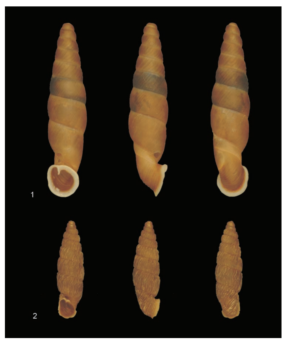
Fig. 1-2. 1 , Columbinia riedeli spec. nov., holotype (UF 410895), Colombia, between Timaná and Elias, actual height 15.9 mm. 2 , Temesa parcecostata dulacki subspec. nov., holotype (MUSM 4048), Peru, Shogosh Bridge near Huancapallac, actual height 9.6 mm.