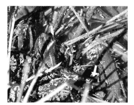
Fig. 2. Rana perezi caught by its right hind leg.

After a detailed survey of the pond edge we found similar situations with other two R. perezi individuals of similar sizes to the injured one. Dragonfly larvae stayed amid vegetation and vegetable remains, and they caught frogs that are above the water surface by their hind legs (Fig. 2).