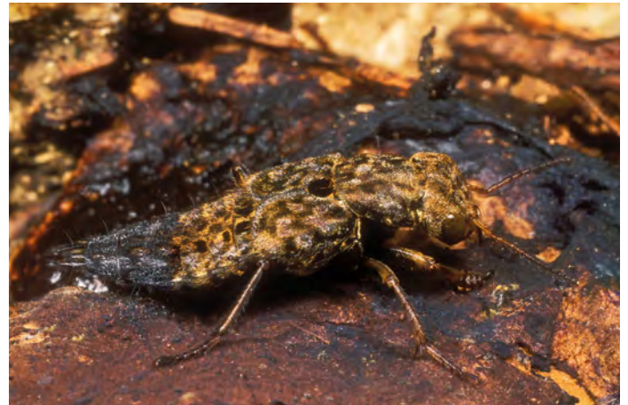
3. Several observed species on cowpats (from upper left and clockwise): adults of Sepsidae, Scathophagidae, Scarabaeidae and Staphylinidae.

3. Enkele waargenomen soorten: imago's van Sepsidae, Scathophagidae, Scarabaeidae en Staphylinidae.