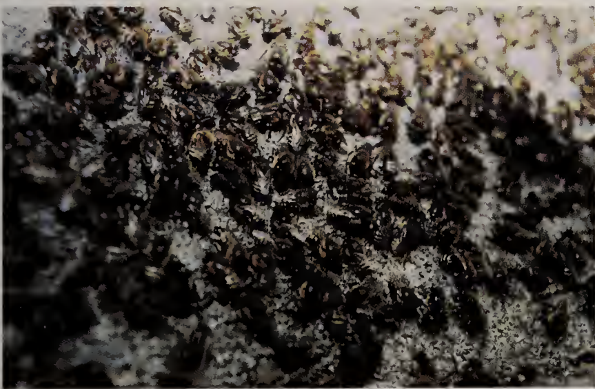
Figure 2. Detail of congregating drones at DCS1.

At all drone congregations we also found workers. At DCS1 and DCS2 there were dead workers on the ground below the site. Obviously, these workers had been fighting, as most specimens were still entangled in fighting positions. Deterio-