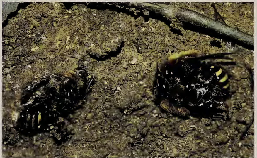
Figure 3. Fighting workers on the ground below the incipient DCS4. Left a killed worker.

Vechtende werksters op de grond onder de zich vormende DCS4. Links een gedode werkster.