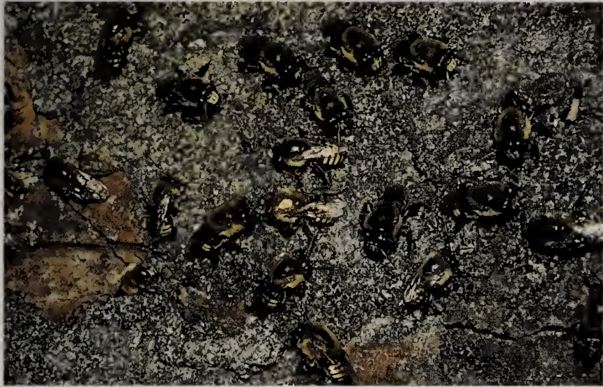
Figure 6. Marked drone soliciting for food from another drone. Een gemerkte dar bedelt om voedsel bij een andere dar.

vered with pollen indicated that they left to visit flowers. Now and then the whole group of males took off suddenly, without any perceivable reason. They sometimes remained hovering in a large cone-shaped group in front of, and orientated towards, the site. At other occasions the males disappeared from the site, to return again after a few minutes. Males also took off upon disturbance. The congregated males always flew up as soon as we collected or touched one of the drones for marking.