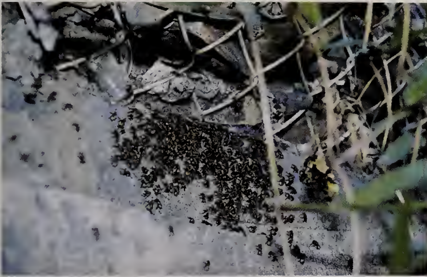
Figure 1. Position of DCS1 on a vertical concrete wall.

Positie van een darrenverzamelplaats (DCS1) op een betonnen muur.