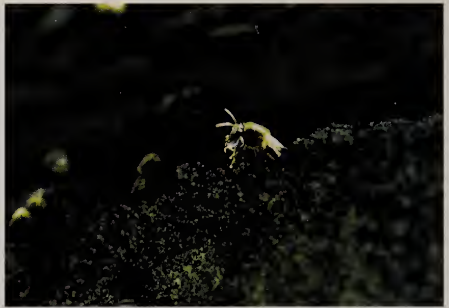
Figure 8. Drone dehydrating a droplet of honey stomach contents, expelled between his mandibles. This is a frequent behaviour of males at the DCS.

Lightly squeezed males in the cages of our experiments may simulate stressed males like those aggressively approached for trophallaxis. The chemicals emitted by molested males have a different effect compared to those emitted by molested workers. Scent released by stressed males attracts gynes, whereas worker scent attracts males. The prompt attraction of gynes to disturbed males illustrates the effectiveness of these male pheromones. The quick appearance of gynes also indicates that gynes are commonly present in the