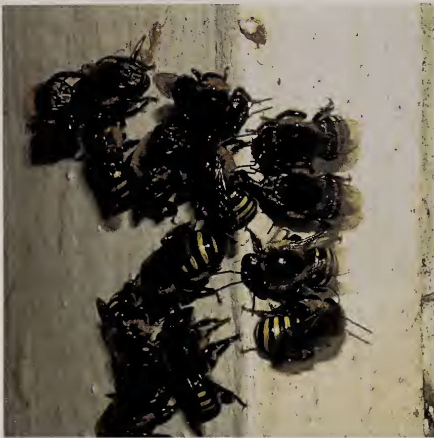
Figure 4. Workers interacting heavily at DCS4. Above a droplet of resin deposited by these workers with on top of this a part of a flower petal.

At all sites we found deposits of plant resin. We actually observed the deposition of plant material by workers at the incipient DCS4 when still very few males were present. Workers deposited plant resin and small parts of white flower petals on the substrate (figure 4). Beside these plant materials we also found mud ridges at the substrate of DCS1. The elaborate mud ridges resembled the typical mud ridges at the entrances of M. favosa nests. We did not observe the actual construction of these ridges but we conclude that they were made by workers since we have never observed drones working at such constructions.