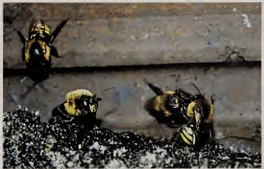
Figure 7. Aggressive food solicitation, in which the drone in the back solicits from the drone in the front. Left a drone with extended glossa and raised antennae. Agressief bedelen tussen darren (de achterste dar bedelt bij de voorste). Links een dar met uitgestoken tong en opgestoken antennen.

Bringing a cage with slightly pressed males near to congregating males resulted in the sudden flying of the congregation away from the cage. After three to five minutes the males returned. The repelling effect of molested males also appeared when a male was taken from a group of resting males.