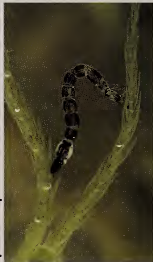
Figure 1. Larva of Lasiodiamesa sp.. Larve van Lasiodiamesa sp..

The larvae of the genus Lasiodiamesa are easily distinguished from other Chironomidae larvae: they are coloured purple, and the segments are clearly delineated (figure 1). The proceri (brush pedestals) on the anal segment are elongated (8-10 times as high as wide) and the brush consists of about thirteen fairly short setae. Other abdominal setae are poorly developed. Other characteristics include a labium with one large middle tooth and twelve pairs of lateral teeth and a ringed third antennal segment (Brundin 1966).