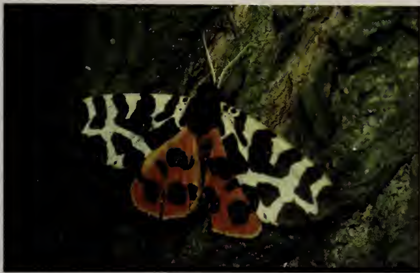
Figure 4. The aposematic and PA sequestering garden tiger Arctia caja .

De aposematische grote beervlinder (Arctia caja). Ook de grote beervlinder slaat PA's in het lichaam op.