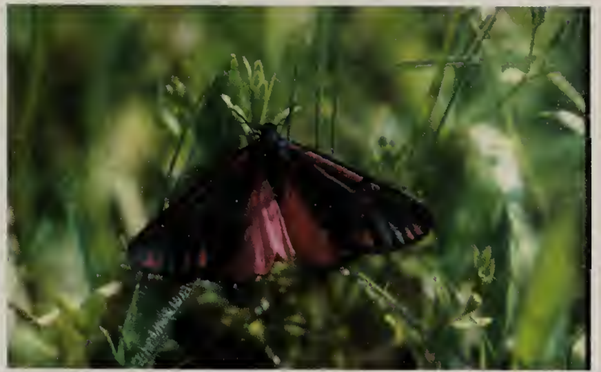
Figure 2. Adult cinnabar moth Tyria jacobaeae . Sint-jacobsvlinder Tyria jacobaeae .

Several insect species go even further in their adaptation to PA's. Many insects do not only cope with PA's in their diet and use them to recognize their food plants and as feeding stimulants, they even sequester PA's for their own defence. Several insect species, like some of the ithomiine butterflies ( Danaus ), Ctenuchiidae ( Euceron , Euchromia ) and Arctiidae