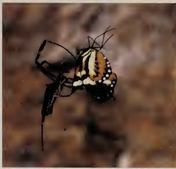
Figure 5. The spider Nephila clavipes cutting a Mechanitis polyminia from its web. Mechanitis polyminia is protected by PA's and therefore rejected by the spider. After release the butterfly will fly off unharmed.

Similar behaviour was found in the moth Cosmonosoma myrodora . Males transmit PA's to the female with the seminal fluid, which the females in turn transfer to the egg surface (Conner et al. 2000).