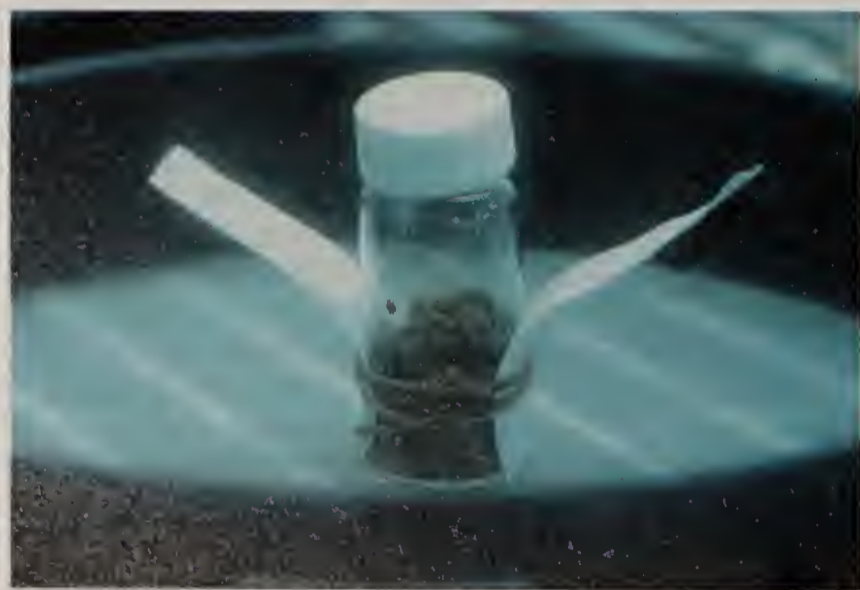
Figure 3. A female cinnabar moth ovipositing on 'filter paper' leaves coated with PA's in a choice experiment.

Larvae and adults of the PA-sequestering Utetheisa ornatrix were protected against predation by wolfspiders (Eisner & Eisner 1991). Also, the PA's in the eggs of U. ornatrix were effective against ants, spiders and lacewings