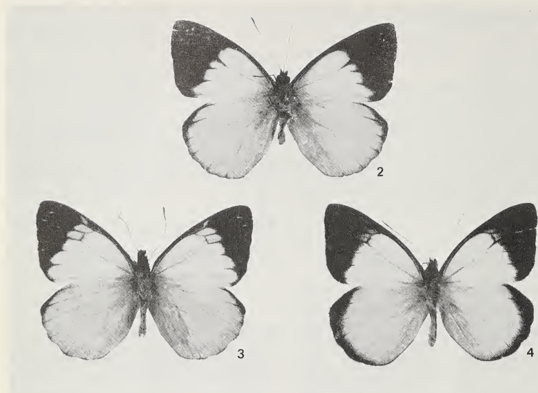
Figs. 2-4. Subspecies of Delias rileyi , uppersides of ♂ holotypes. 2, D. rileyi rileyi ; 3, D. rileyi yofona ; 4, D. rileyi nishizawai . Natural size.