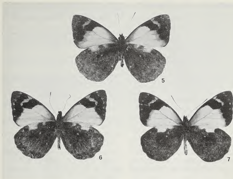
Figs. 5-7. Subspecies of Delias rileyi , undersides of ♂ holotypes. 5, D. rileyi rileyi ; 6, D. rileyi yofona ; 7, D. rileyi nishizawai . Natural size.

rileyi rileyi ; black veins M_3 and M_2 connect border with black LDC; 2-4 small white subapical and terminal spots. Inner edge of black border serrate. Upperside of hind wing as in rileyi . Underside of fore wing proximally white; brown border in cells M_3 , Cu_1 and Cu_2 about 0.5 mm narrower than on upperside. An irregular white tortuous stripe from costa to vein M_3 or sometimes connected with white part, separates broad discocellular bar from reduced brown border, which bears six yellow subapical and terminal spots. A dark yellow streak runs from base of discal cell along costa. Underside of hind wing lighter brown and with more obvious yellow parts.