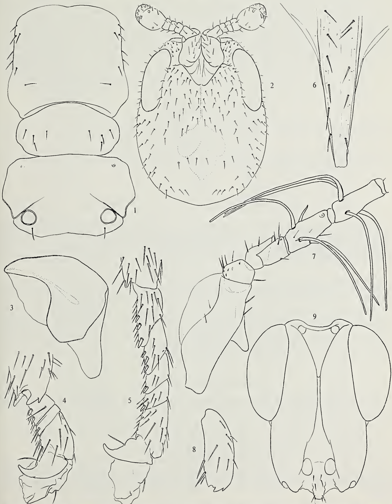
Figs. 1—9. Agaon megalopon nov. spec. 1—5, male; 6—9, female holotype. 1, thorax; 2, head; 3, mandible, dorsal aspect; 4, apex of fore tibia, and tarsus, antiaxial aspect; 5, apex of hind tibia, and tarsus, antiaxial aspect; 6, hypopygium; 7, proximal segments of antenna, axial aspect; 8, fore tibia, antiaxial aspect; 9, head. Magnification of figs. 1, 2, 9 \times 100 ; other figs. \times 200 .

Gaster. The genitalia simple, without parameres or claspers. Length (head and thorax), ca. 1 mm long. Colour yellowish, the head somewhat darker.