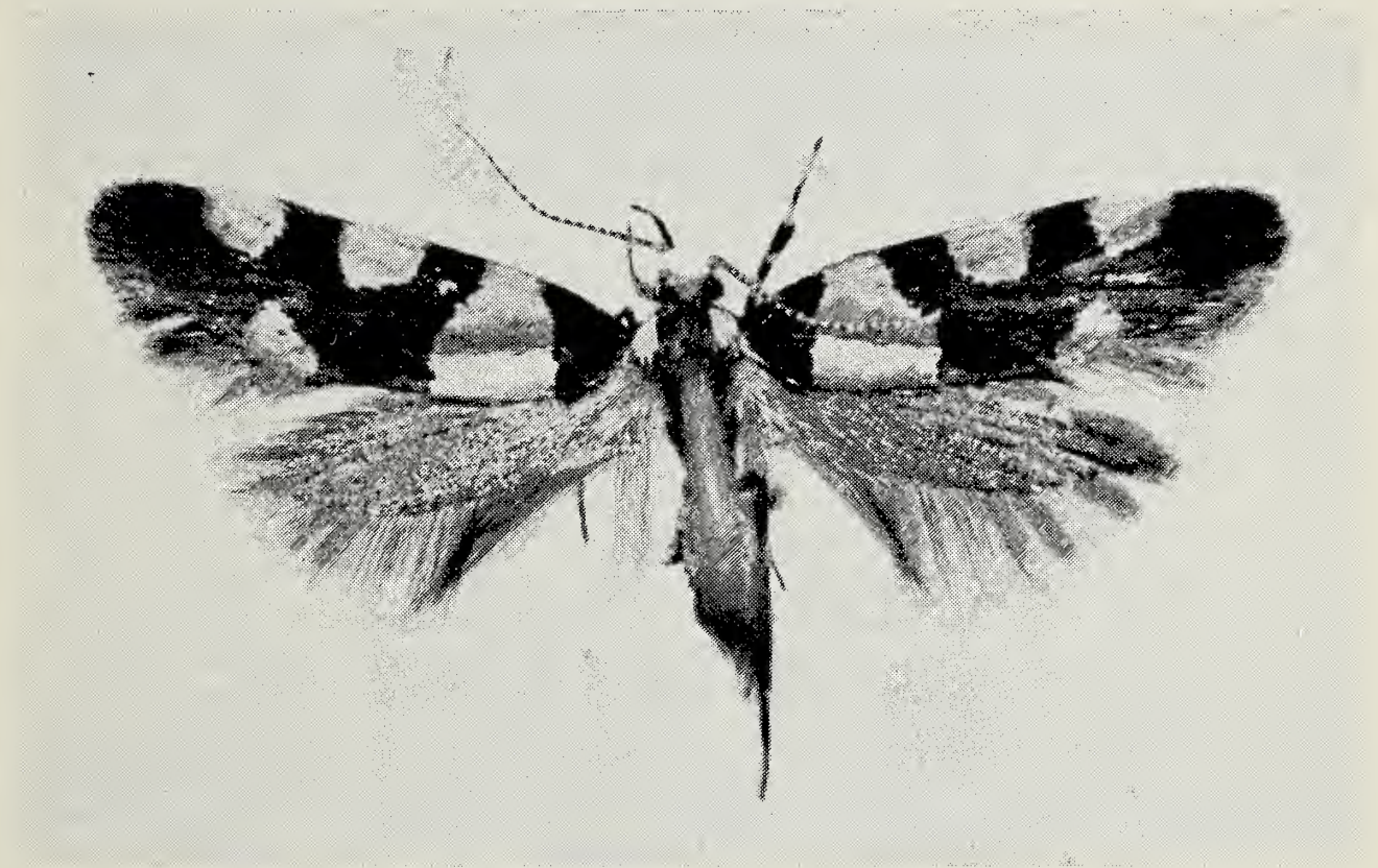
Fig. 1. Eratophyes aleatrix gen. et spec. nov., ♂.

Some time ago the promising collector of Dutch Microlepidoptera, Dr. A. Cox, caught near Elden, a small village in the eastern Dutch province of Gelderland, a single male specimen of a small species of elegant, rather striking appearance: black, with large pale yellow spots (Fig. 1). It slightly resembled Gelechia tesella Hübner, but closer study and dissection of the genitalia soon revealed that the insect was an oecophorid. I did not succeed, however, in identifying it any further, in spite of the very kind help of several colleagues all over Europe and even overseas. I am greatly indebted for this help to: H. G. Amsel, Karlsruhe Museum; J. D. Bradley, Common-