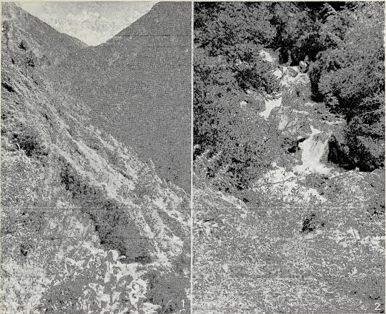
Fig. 1. Dudh Kosi Valley from the trek Lughla — Namche Bazar. In the background Mt. Everest (left) and Lhotse (right). The syrphid flies were collected in the upper part, at the confluence of Dudh Kosi and Phunki Drangka.