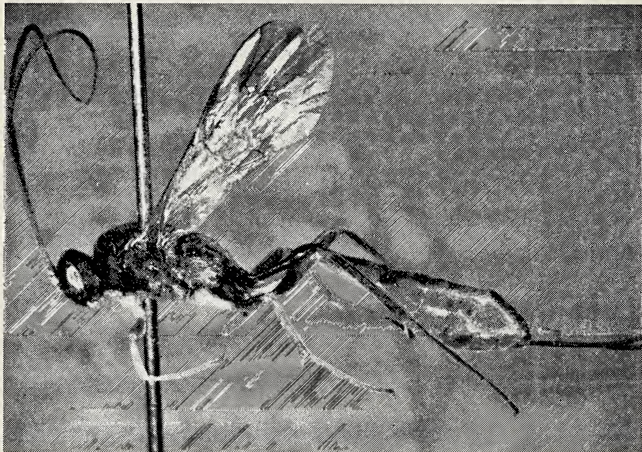
Fig. 1. Venturia ovivenans n.s., female paratype.

Epomia present; punctation on pronotum merging into rugulosity, but not clearly striate as in the well known V. canescens ; rest of thorax very densely punctate (denser than in V. canescens ), except for the speculum. Sternaulus absent and notaulus weakly impressed. Propodeum nearly completely areolated, first and second pleural areas united; areola closed behind, convergent behind costulae; carinae at apex of propodeum somewhat obscured; punctation dense, in apical half rugose but not clearly transversely striate; apex of propodeum reaching to middle of hind coxa or a little beyond. Thorax + propodeum comparatively very long (fig. 1).