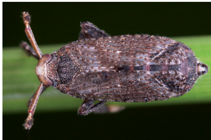
8. Female of Asiraca clavicornis , Perchtoldsdorfer Heide, Niederösterreich, Austria, 03.vi.2007. 8. Vrouwtje van Asiraca clavicornis , Perchtoldsdorfer Heide, Neder-Oostenrijk, Oostenrijk, 03.vi.2007.