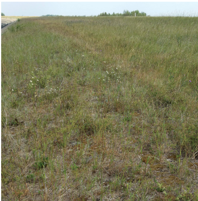
7. Location of Trigonocranus emmeae , Sint Philipsland (province of Zeeland), the Netherlands, 10.vi.2020. 7. Vindplaats van Trigonocranus emmeae , Sint Philipsland (Zeeland), Nederland, 10.vi.2020.