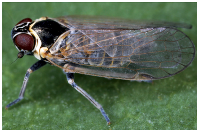
1. Male of Hyalesthes obsoletus , Geddelsbach, Baden-Württemberg, Germany, 6.vii.2009. 1. Mannetje van Hyalesthes obsoletus , Geddelsbach, Baden-Württemberg, Duitsland, 6.vii.2009.