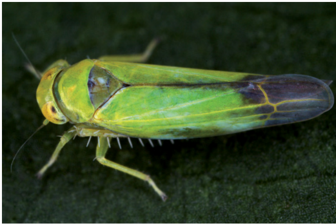
3. Male of Alebra viridis , Freistritzklamm, Steiermark, Austria, 13.viii.2008.