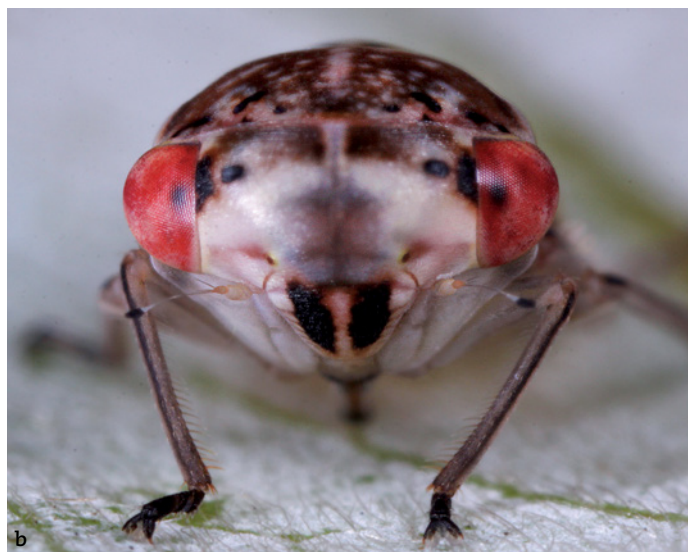
6. Male of Idiocerus vicinus : (a) dorsolateral, (b) frontal. NR Gesäuse, Steiermark, Austria, 22.vii.2007.