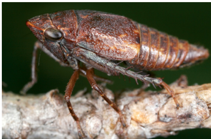
9. Male of Errhomenus brachypterus , NR Gesäuse, Steiermark, Austria, 23.vii.2007.

Material Province of Limburg: nature reserve Sint Pietersberg, groeve bij Franse Batterij (AC 175-315), 17.ix.1949, 2 ♂ 3 ♀, leg. Excursie St Pietersberg, col. Naturalis; Bemelen, nature reserve Bemelerberg, 9.vi.2019, 1 ♀, photo on website Waarneming.nl, leg. P. Hoekstra; same locality (AC 181.5-317.8), 24.vi.2020, 3 ♂ 3 ♀, leg. & col. C.F.M. den Bieman; Brunssum-Treeberg (AC 194.6-327.6), 24.viii.2019, one adult on light; same locality, 25.viii.2019, one adult on light, both photos on website Waarneming.nl, leg.