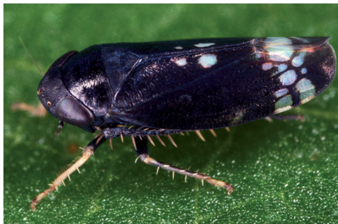
10. Male of Neoliturus fenestratus , Darmstadt, Hessen, Germany, 01.ix.2008.

9. Mannetje van Errhomenus brachypterus , NR Gesäuse, Stiermarken, Oostenrijk, 03.vi.2007.