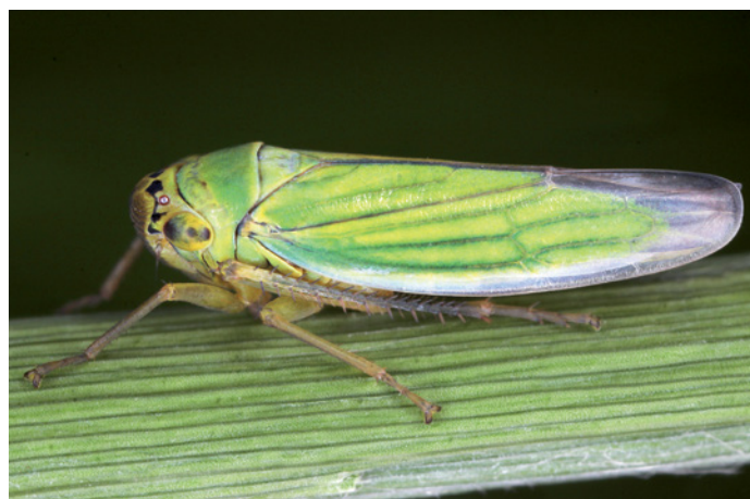
2. Female of Cicadella lasiocarpae , Immenstadt, Alpsee, Bayern, Germany, 7.vii.2010. 2. Vrouwtje van Cicadella lasiocarpae , Immenstadt, Alpsee, Beieren, Duitsland, 7.vii.2010.

Though C. lasiocarpae was described quite recently in 1981, it has been found in large parts of the northern Palearctic: Belarus, Czech Republic, Denmark, East Palearctic (Siberia and Korea),