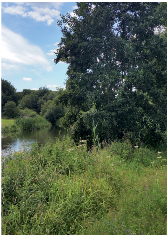
5. Location of Kybos mucronatus , Breda (province of Noord-Brabant), the Netherlands, 22.vii.2020. 5. Vindplaats van Kybos mucronatus , Breda (Noord-Brabant), Nederland, 22.vii.2020.

Alnus glutinosa , all leg. & col. C.F.M. den Bieman; Udenhout, nature reserve De Brand (AC 137.4-404.8), 27.vi-4.vii.2020, 1 ♂ in malaisetrapp, leg. IWG KNNV-Tilburg, col. M.C. de Haas; same location, 18-25.vii.2020, 1 ♂ in malaisetrapp, leg. IWG KNNV-Tilburg, col. M.C. de Haas.