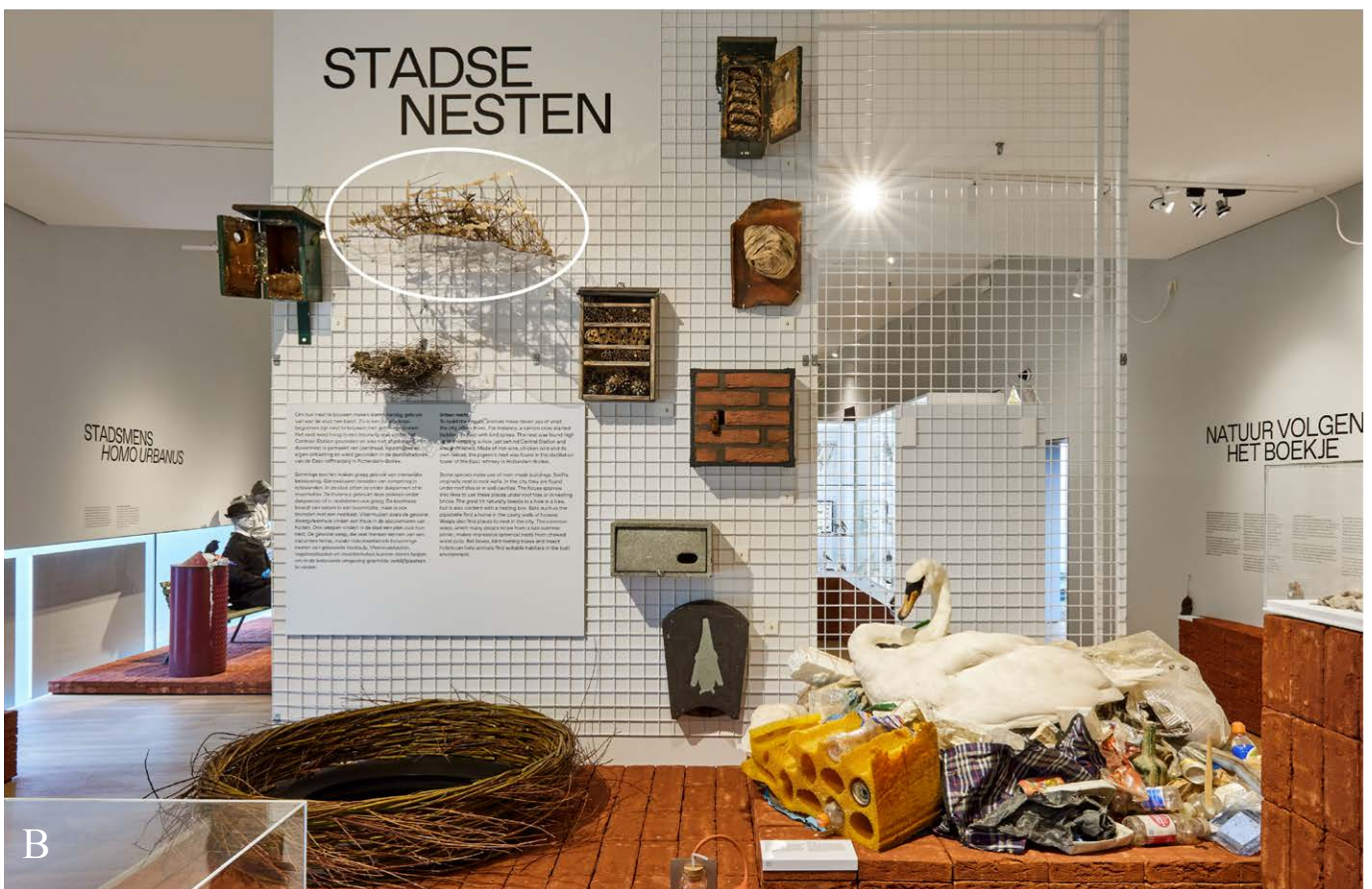
Figure 2 A The magpie nest made out of anti-bird spikes on display in Naturalis Biodiversity Center (RMNH.AVES.259588), an object not only of scientific but also of great educational value. The museum hall Live Science, in which the nest is shown, has free access to the public. B The Natural History Museum Rotterdam shows a wide range of urban nests, including the anti-bird spike crow nest (NMR998900189467) (encircled) in the exhibition 'National Park Rotterdam'.