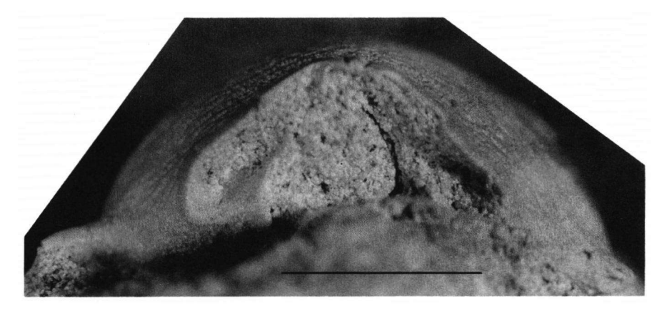
Fig. 3. Raniliformis baltica (Segerberg, 1900) nov. comb. As Fig. 1; frontal view of carapace. Scale bar equals 10 mm.

Tuffkreide. — Verhandlungen der naturhistorischen Vereins in preußisch Rheinland und Westfalen, 14: 107-110, pls 5, 6 [1, 2].