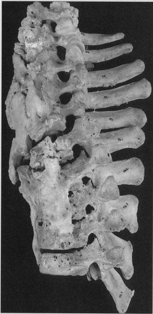
Figure 4 Pongo pygmaeus pygmaeus (ZMA 24488), lateral view of the third cervical to fifth thoracic vertebra.

The intervertebral spaces, however, are normal and show no perforations and/or sclerosis of the epiphysis. The first thoracic vertebra shows normal epiphysis, but severe marginal osteophytes. The following four thoracic vertebrae are also fused together by a grotesque ankylosis. Again, the intervertebral spaces and epiphyses are normal. The following thoracic and lumbar vertebrae show only degenerative changes consistent with the age of the animal. The other extraspinal bones of the skeleton and the skull show no gross pathology. The teeth are worn and the jaws show the results of periodontitis, which is normal for a primate that lived in a zoo for several years.