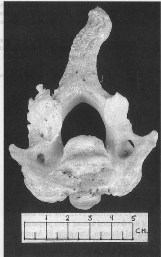
Figure 1 Pongo pygmaeus pygmaeus (ZMA 24488), second cervical vertebra; note the severe macroscopic bone changes on the left inferior articular process.

Autopsy on the dead Pongo was performed one day after death. A mild splenomegaly and some chronic ulcerations in the colon were found. Some mesenteric lymph-nodes were enlarged, having a purulent content. The intriguing pathology of the vertebrae became visible after cleaning the skeleton by maceration. The atlas shows a small osteophyte on the inner side of the lateral mass. The second cervical vertebra shows severe pathology (Fig. 1). The left inferior articular process shows severe macroscopic bone changes. The whole area of contact is covered with perforations and there are marginal osteophytes.