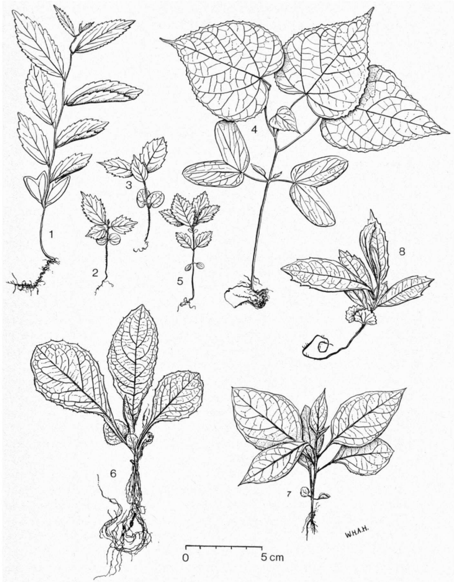
Figs. 1-8. Figures of seedlings: 1 Celtis iguanaea ; 2 Luehea divaricata ; 3 Luehea candicans ; 4 Buettneria catalpifolia ; 5 Lamanonia speciosa ; 6 Lobelia hassleri ; 7 Celosia grandifolia ; 8 Patagonula americana .