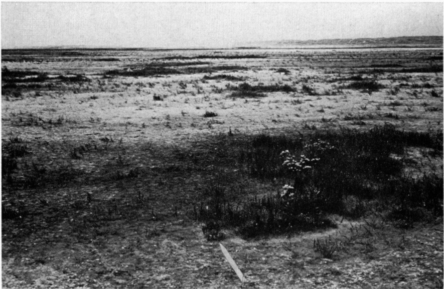
Photo 2. View of the habitat of S. media of "De Boschplaat" north of the dunes (Terschelling). The population grows on the bare sand plain and in the lower parts of the vegetation cover (see arrow); it contains about 30% of plants that produce exclusively unwinged seeds.

These data indicate that in corresponding types of habitat a corresponding range of variation is found. Transplantation experiments and rearings of plants from seed in the experimental garden have shown that the differences between the populations occurring in the above-mentioned habitats are chiefly attributable to a different genetic predisposition of these populations. There are, accordingly, good reasons to assume that the differentiation between the populations is an ecotypic one.