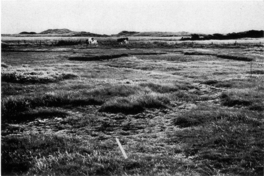
Photo 3. The habitat of S. marina of "De Grie" (Terschelling) situated between the duck-ponds. The population contains about 70% of plants that produce broadly winged seeds.