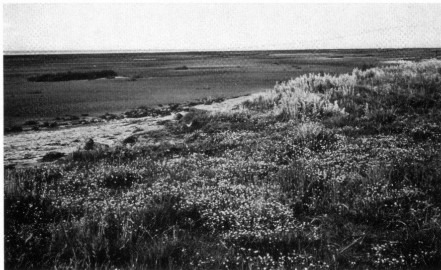
Photo 1. View of the habitat of S. media of "De Grie" (Terschelling). The population grows in a dense stand on a clayey soil and consists of plants that produce broadly winged seeds.