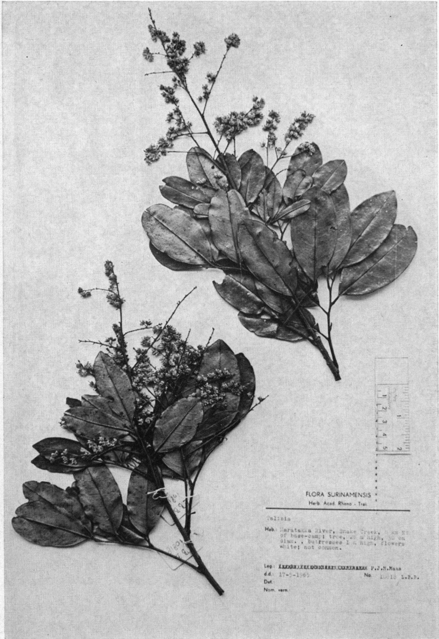
Plate 1. Type sheet of Talisia simaboides Kramer.