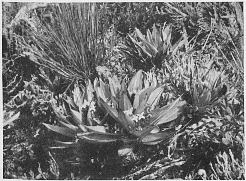
Fig. 1. Three young specimens of Pleiocraterium sumatranum Brem., one of them with flowers and fruits. G. Losir, ca 3400 m. alt.