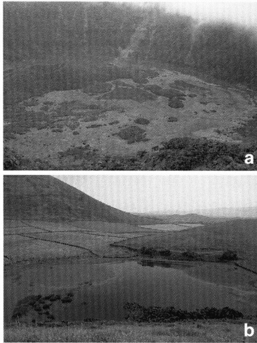
Fig. 2. Two examples of a typical I. hastata habitat at the Azores: (a) Caldeirão (Faial), which is included in the Natura 2000 network; – (b) Lagoa do Ginjal (Terceira). Note the presence of abundant vegetation.

These parthenogenetic populations are an exceptional occurrence within the Odonata, and possess a high intrinsic value for conservation. There is some evidence, although anecdotic, of recent extinction in some ponds. For example, in 1988 I. hastata was common at Lagoa do Capitão (Pico) (BELLE & VAN TOL, 1990), and we recorded some specimens there in July 2000; nevertheless, in July 2003, this pond had no longer emergent shore vegetation, which had been probably destroyed by stepping cattle, and we could not find any specimen. Also, there are no recent records from São Jorge and Santa Maria, from which the species was reported by VALLE (1940) and GARD-