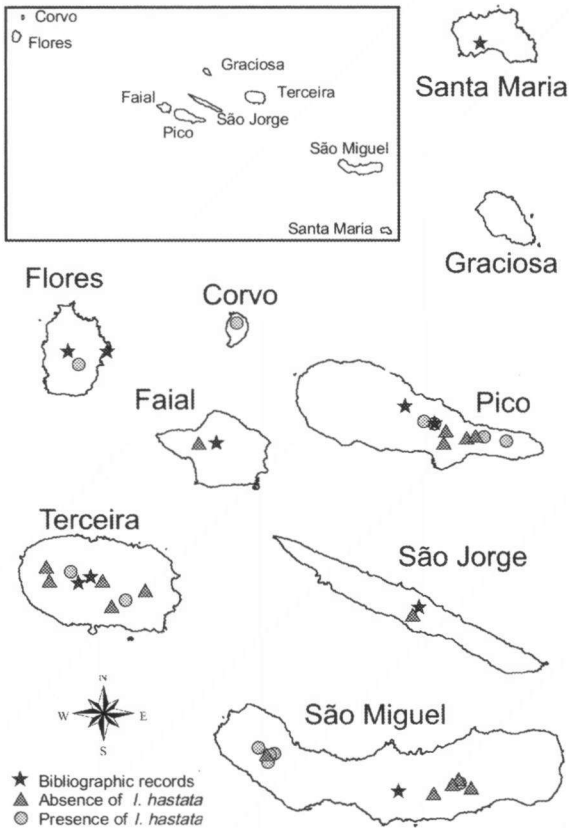
Fig. 1. Distribution of I. hastata in the Azores, based on our and on literature records.

recorded I. hastata are protected: Caldeira (Faial) as a Nature Reserve (proposed as part of the Natura 2000 network), Lagoa do Caiado (Pico) and Lagoa do Negro (Terceira) included in Forest Reserves and the group of Lagoas das Empadadas, Carvão, Canário e Caldeirão (São Miguel) apparently included in the Protected Landscape of Sete Cidades.