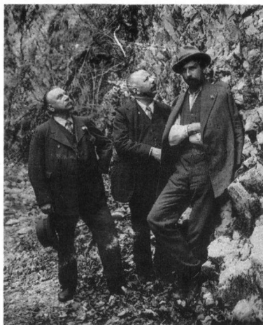
Fig. 2. For explanation see text.

Brief references to these are given in OA 8212 ( Odonatologica 21[1992]: 259) and in I. GEIS-TER's Editorial in Enviæ 1[1994]: i).