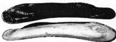
Gigantidas gladius Von Cosel & Marshall, 2003. holotype, 260 mm. — The Nautilus 117(2): 39.