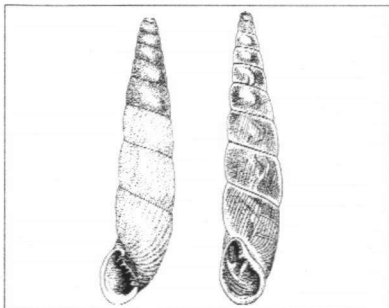
Pravispira semilamellata (MOUSSON) - EGOROV, 2001, Treasure Russian Shells, 5 (1): fig. 5A-B.