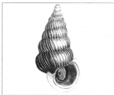
Cochlostoma hoyeri (POLINSKI) - POLINSKI, 1922, Ann. zool. Mus. polon. Hist. nat., 1 (4): pl. 12 fig. 1.