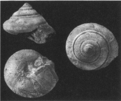
† holotype, composite state of preservation. — Paleont. Res. 9(4): 338.