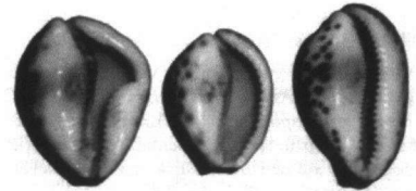
Freaks of Cypraea tigris from Kenia. – Club Conchylia Informationen 38(3-4):3.