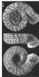
Monilearia (Lyrula) tubaeformis