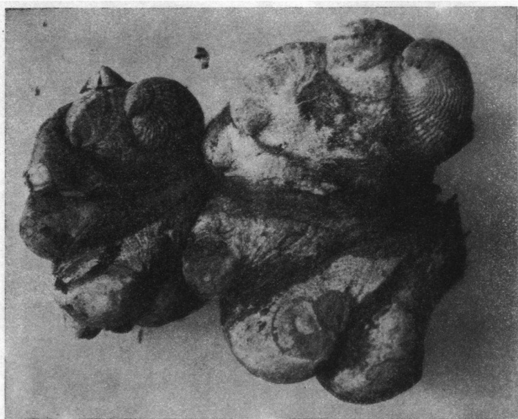
Chains of Crepidula fornicata (L.)