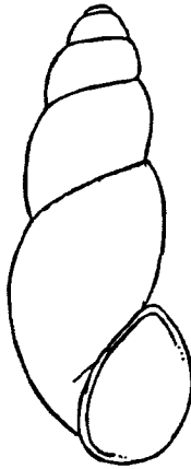
Fig. 2. Hyala vitrea , shell with a deep suture; height 2.8 mm.

and Dogger Bank, Hyala vitrea was not even found at nearly a thousand stations. Furthermore, on the Oyster Ground the species is not really common. The, by far, highest density found is 59/0.068 m 2 . However, H. vitrea has been found in three new 'atlas areas' of the British Conchological Society (Seaward, 1982, 1990), viz. S10 Dogger, S51 German Bight, and S52 Texel.