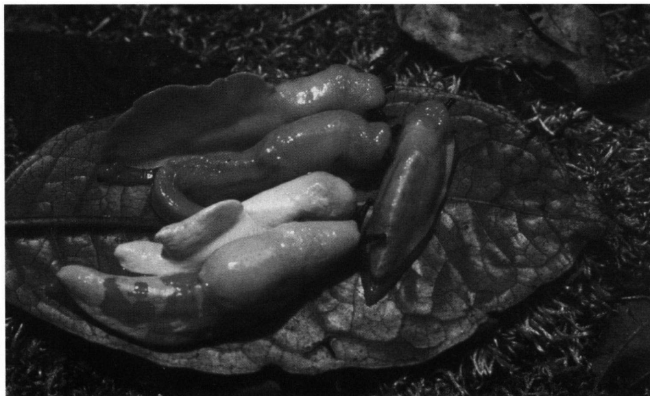
Fig. 1. Group of Emphysetes udzungwensis spec. nov. (arranged on leaf by collector), Tanzania, Udzungwa Mts Mt. Luhomero, 2200 m, Quentin Luke photo, October 2000.

In September 1985 I was sent two slugs for examination which had been collected on grasses on 16 August 1985 in Ocotea-Hagenia forest at 1900–2300 m in the Udzungwa (Uzungwa) Mts. in the Iringa District of Tanzania by J.B. Hale and W.A. Rodgers. The slugs were said to be yellow and 10 cm long. In spirit the body was buff with a dull purple fringe; the back is strongly keeled from mantle to caudal gland. Dissection revealed