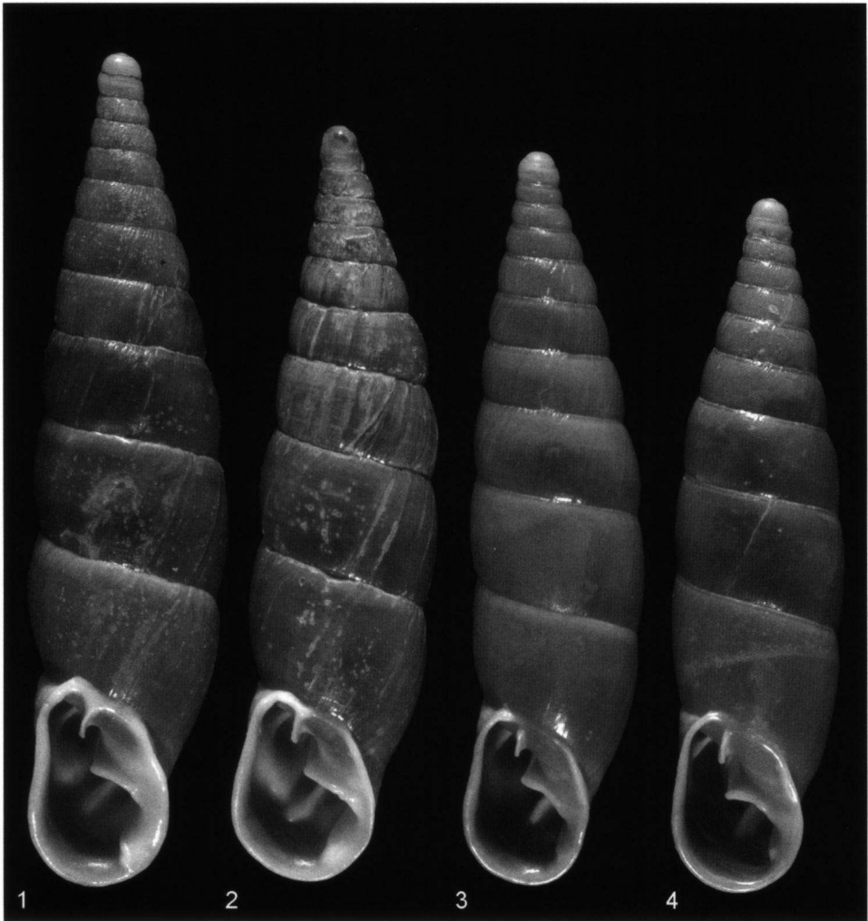
Figs 1-4. Cochlodina ( C. ) laminata subspec. 1, 2, C. (C.) l. inaequalis (Schmidt, 1868), Croatia, Istra, Ucka Mtn, 800-950 m alt., UTM VL31; E. & A.C. Gittenberger leg. (1, 20.6×4.9 mm; 2, 18.6×4.5 mm). 3, 4, C. (C.) l. insulana Gittenberger, 1967, Croatia, Krk island, near Risika (= W. of Vrbnik), UTM VK79; W.J.M. Maassen leg. (3, 18.2×4.4 mm; 4, 17.2 ×4.3 mm). Photographs: J. Goud, Leiden.

Measurements ( n = 37 ): 17.6-19.9 × 4.5-5.0 mm. Gittenberger (1967: 32), on the basis of a larger material, reported a larger size-range, viz. 18.0-21.0 × 4.3-5.0 mm.