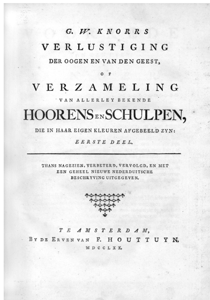
Figure 4. Title page of Dutch edition.

Derde deel. Thans nagezien, verbeterd, vervolgd, en met een geheel nieuwe nederduitsche beschryving uitgegeven. te Amster-