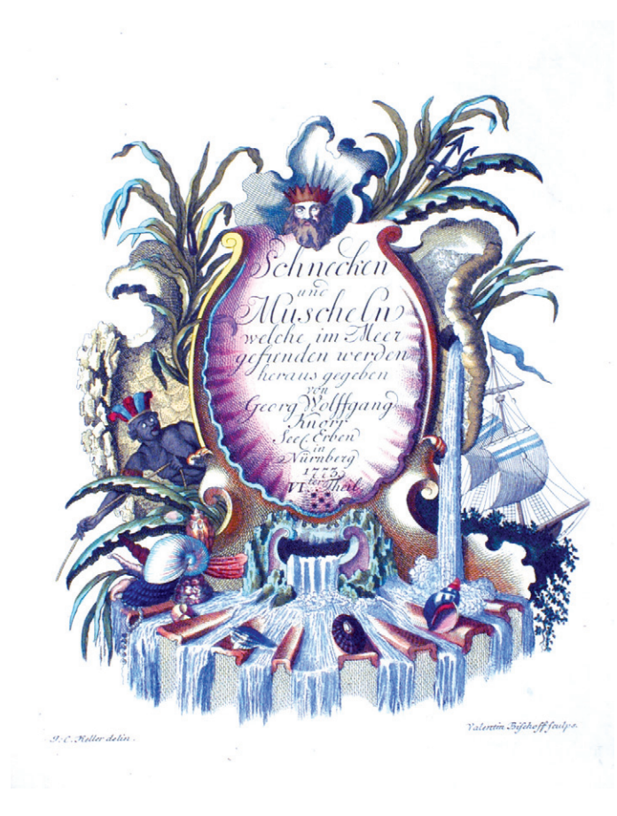
Figure 10. Frontispiece to Part 6 of the German edition.

Schadeloock , August Martin (1707–1774): deacon of the Laurentius church at Nuremberg. Plate legends engraved Ex Museo Schadeloockiano appear in all editions on 16 plates in Part 1 and 14 Plates in Part 4. One Plate in Part 3 in all with a joint inscription including Breyn. Redrawn Plates in the French and German editions have legends as mentioned