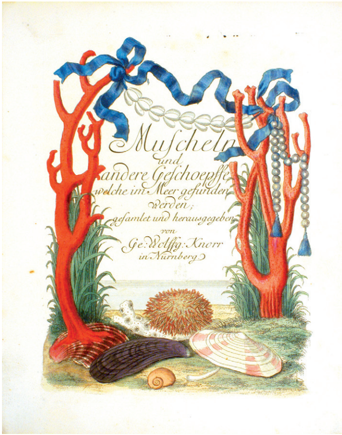
Figure 5. Frontispiece to Part 1 of the German edition.

Dance & Heppell (1991) figured Knorr's Plate 1**** from Part 6 which has at its center Conus cedonulli Linnaeus, 1767, and gave the history of this famous shell. They figured the plate from the Dutch edition of 1775 but did not mention that the same plate appeared earlier in the French and German editions. The Plates are identical in all editions except that Cedo nulli [sic] was engraved above the figure number in the French and Dutch editions, an addition not in the German edition.