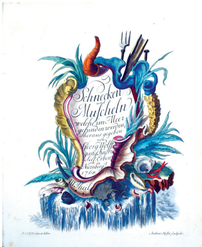
Figure 7. Frontispiece to Part 3 of the German edition.

A most unusual feature of this work is the appearance of an additional ten uncoloured plates in Part 6 (Plates XXXI****–XL****). Dance (1966: 74; 1986: 50) stated that the last ten plates are “white on a dark ground” as they were issued after Knorr's death, a statement quoted by some anti-quarian book dealers although most of the work was published after Knorr's death. The reason is given within the work (Dutch edition, Part 6, page 107) where it is stated that since most of the specimens figured are white and could be not figured on a white background, it was decided to illustrate them uncoloured on a black background. These ten “black and white” plates are not coloured white but are uncoloured and the black background is painted in. White