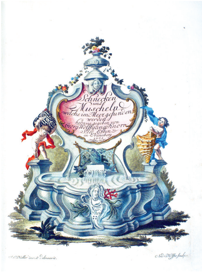
Figure 9. Frontispiece to Part 5 of the German edition.

Civ. Capitan Amstelodam vigilantissimi . Plate 11 in Part 6 of all editions is inscribed Fig. 2-6 Ex Museo Houúttúyniano without mention of Figure 1. In the Dutch edition (p. 75) that specimen of Corculum is stated to be from W. van der Meulen.