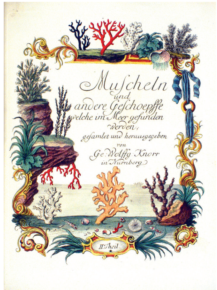
Figure 6. Frontispiece to Part 2 of the German edition.

in a boat hauling in a net. The inscription on the fountain is: Collection des différentes espèces de coquillages qu'on trouve dans les Mers rassemblée et communiquée au Public par les Heritiers de George Wolfgang Knorr a Nuremberg 1771 V me Partie . This is the only frontispiece that does not show, somewhere in the inscription, the number of asterisks [*] on the plates in the part. Both were drawn by Keller, with the German one being engraved by Hoffer and the French version by Trautner. However, the German Part 5 frontispiece has, in very small engraving in the upper inscription area under 1771, P. Küffner sculps. As the artist's and engraver's names are