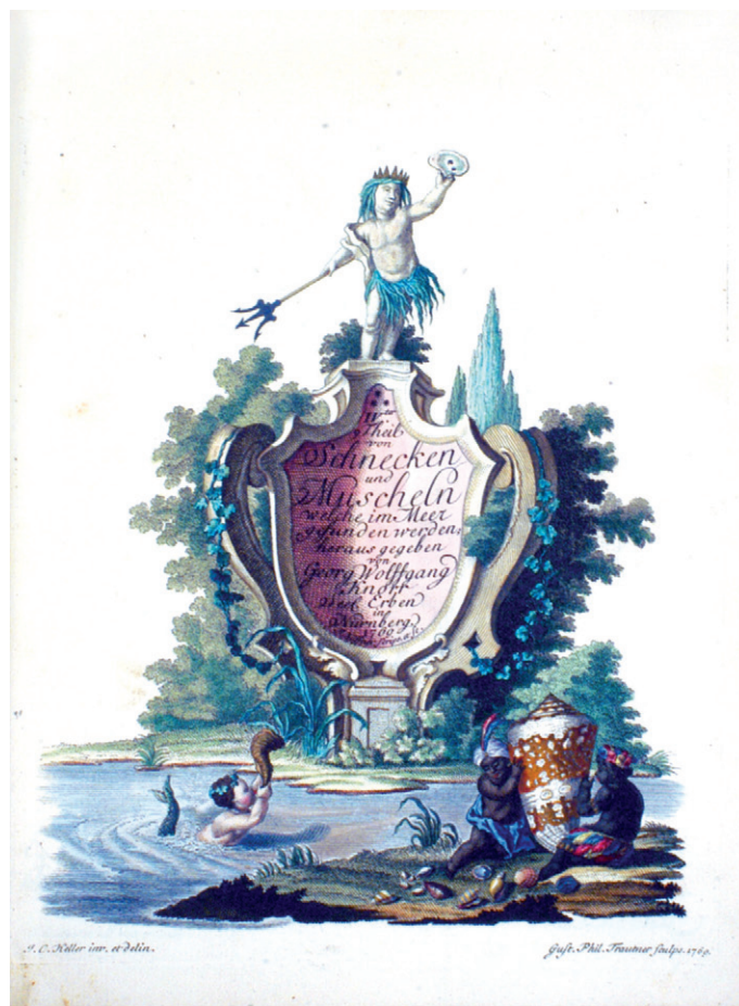
Figure 8. Frontispiece to Part 4 of the German edition.

paint was applied over the imprinted plate numbers so that they could be read. A few of the shells on these ten plates received some shading in gray. The Argonauta on Pl. XXXI**** has been shaded with brown and light brown bands have been added to a muricid on Plate XL****.