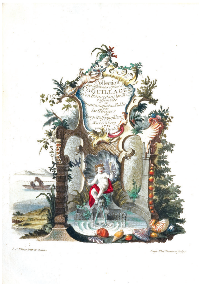
Figure 11. Frontispiece to Part 5 of the French edition.

Sommer, J. H. (?-?): unknown. I have located this name in the conchological literature only in a reference to “the 1759 Paris auction of the collection of the British collector Sommer” (Dietz 2006: 378). I consider it unlikely that this is the Sommer whose shells were figured on Plates 5 and 13–15 and 17 of Part 4. Those plates are inscribed Ex Museo Sommeriano . Also in Part 4, Plates 9, 16, and 18–19 are composed of specimens from both the Sommer and Schadeloock collec-