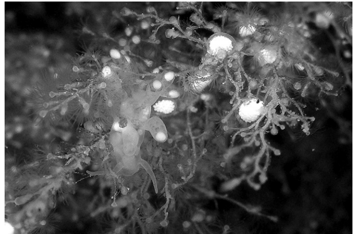
Fig. 2. Egg masses of the nudibranch Tergipes tergipes attached to hydroids ( Obelia spec.).

Baster had no idea to which species this spawn belonged, but his acquaintance Leendert Bomme stated in an unpublished manuscript that the egg mass drawn by Baster belonged to a sea slug (Bomme, 1769). In fact, there is no doubt about Bomme's assumption that these egg masses that frequently occur, belong to nudibranchs (M. Faasse, G. van Moorsel, pers. comm.). Nudibranchs that lay small compact egg masses along the Dutch coast belong to Tergipedidae or Eubranichidae (Swennen & Dekker, 1987; van Bragt, 2004). Based on the frequency and the radial symmetry of the egg mass, Tergipes tergipes (Forskål, 1775) is the most probable species to have spawned these eggs (Fig. 2).