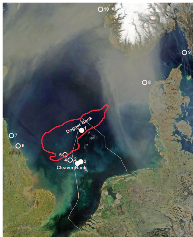
Fig. 1. Records of Xandarovula patula in the North Sea (Rowley, 2008; Høisæter et al., 2011; Staal, 2005; Taekema, 2005). The dots indicate the records in The Netherlands; the circles represent records elsewhere in the North Sea.

Diagnosis. — The specimens were identified as Xandarovula