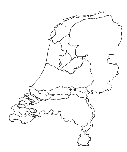
Fig. 1. Map of The Netherlands with the major water courses. Dots indicate the localities where Bythiospeum husmanni has been collected from archaeological sites.

dug. It concerns Holocene deposits of the river Rhine that consist of clay and sandy clay. The age of the deposit is estimated around 3000 years BC. This material was deposited as levee and/or so-called crevasse deposits and back swamp clays.