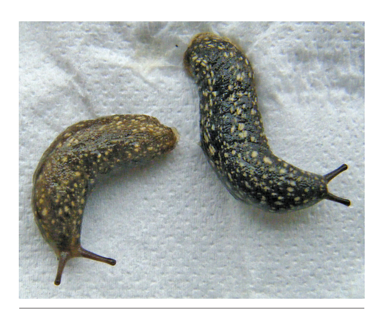
Fig. 1. Woodland (left) and open (right) forms of Geomalacus maculosus.

marily comprised of Picea sitchensis and Pinus contorta ). The species was first reported in M03 by Kearney (2010) and we recorded it consistently there on conifers and on granite outcrops on blanket bog from January 2010 to February 2011. Until the recent discovery of the species in Co. Galway, G. maculosus was thought to be found in Ireland solely in areas where the underlying geology was sandstone. Its presence on granite, therefore, raises questions about its reported habitat and geological specificity in Ireland. To help address this issue it is useful to examine the geological associations of the species in northwest Iberia where G. maculosus has been recorded on granites, slates, quartzite, schists, gneiss and serpentine (Castillejo et al., 1994) so its presence on granite in Co. Galway then may be considered relatively unsurprising. Nevertheless, this association has obvious implications for future national surveys and the conservation of the species in Ireland.